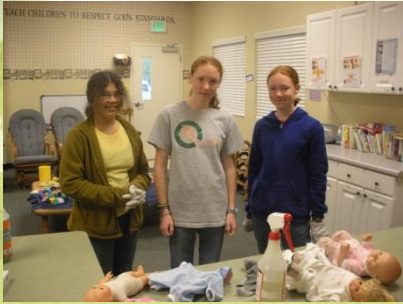
HIT Team service project – classroom cleanup

Maintaining church attendance at least 3 Sundays per month.