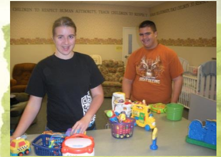
HIT Team service project – classroom cleanup

How does a HIT Team member minister to others?