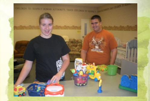
HIT Team service project – classroom cleanup

Ministry How does a HIT Team member minister to others?